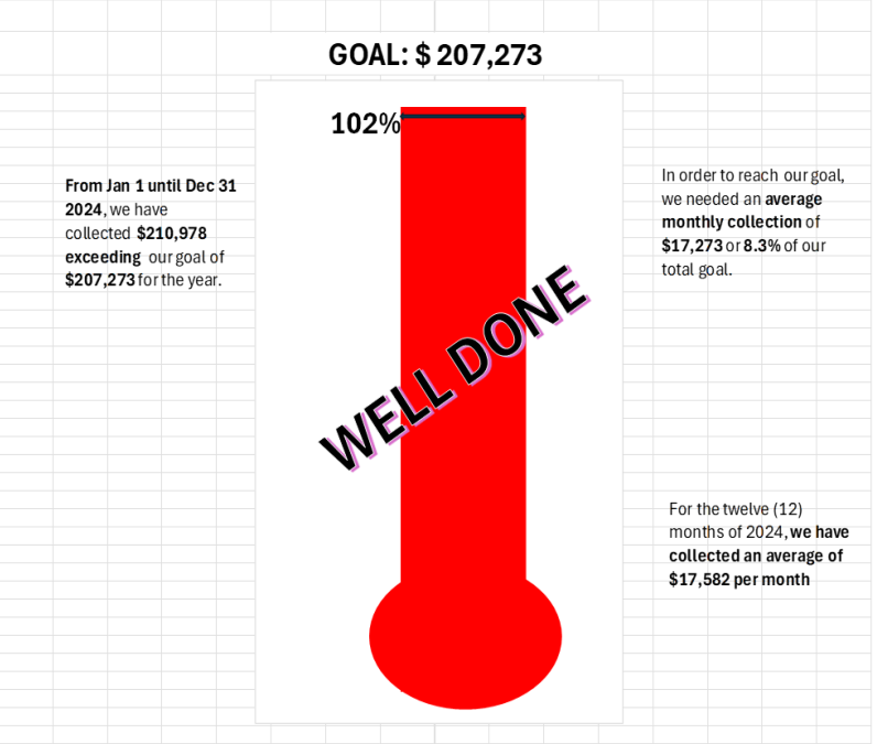
2024 St Jean the Baptiste Parish Projected Budget