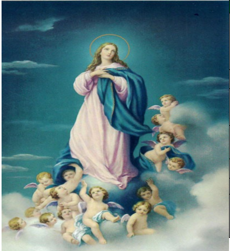
Assumption of the Blessed Mother