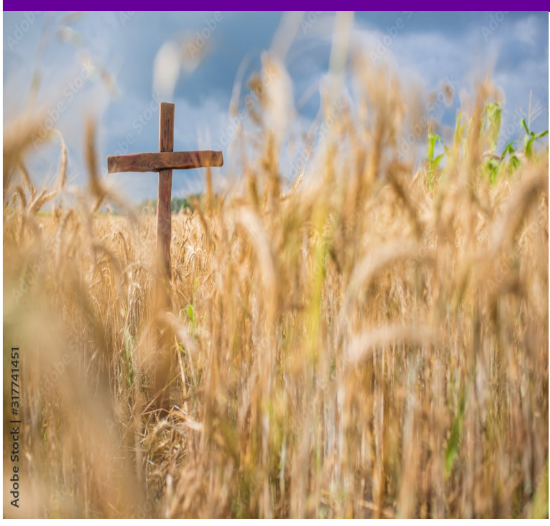
New Rebuild Donation options